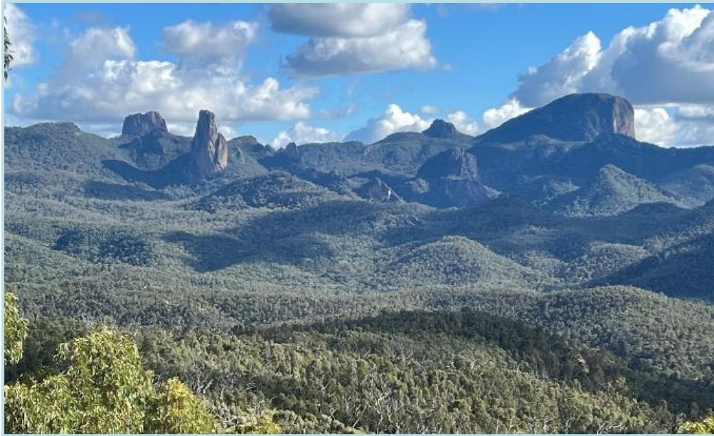
Warrumbungle National Park