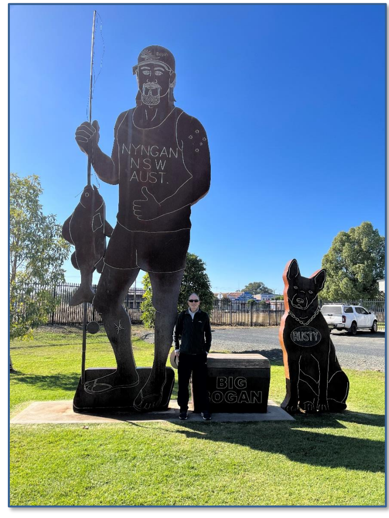
Your editor dwarfed by the Big Bogan in Nyngan NSW

Cobar was the logical place to stop between Dubbo and Broken Hill. It is a remote but